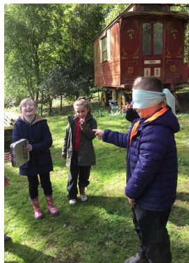
Class 3's Forest School

Saturday 9 th May - Clun Valley Challenge Walk Monday 11 th May - SATS Week Tuesday 12 th May - Class 3 Swimming Tuesday 19 th May - Class 3 Swimming Wednesday 20 th May - Class 4 Forest School Thursday 21 st May - Goblin Car Trials Bishops Castle Thursday 21 st May - Class 3 & 4 Pond Dipping Friday 22 nd May - Reception Visit to Hay Festival Tuesday 2 nd June - Class 4 Swimming Thursday 4 th June - Goblin Car Race Day Friday 5 th June - Class 3 Trip to Xplore Wrexham Thursday 25 th June - Year 6 Leavers Service Hereford Cathedral Tuesday 30 th June - Sports Day